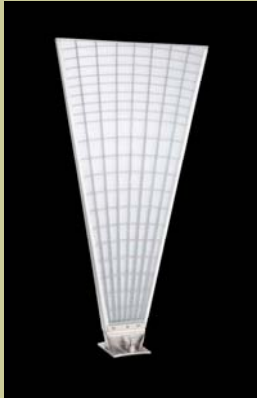
12 Ft. Rod and Rail Sector