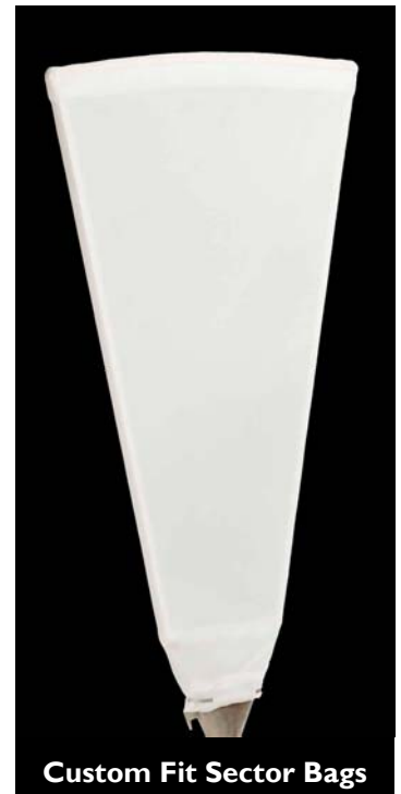
Custom Fit Sector Bags